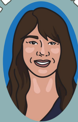
SOCIAL MEDIA MANAGER & MARKETING