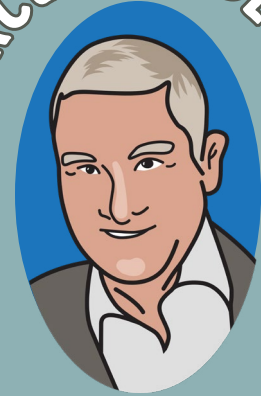
FINANCE & TECHNICAL ADVISOR