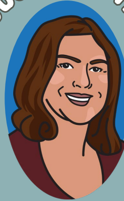
INTERNATIONAL MARKETING (HONORARY)