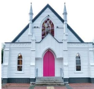
The Good Union

Looking for a “nook or cranny” to hide away over a cold beer or glass or wine The Shearers Quarters Cafe offers just that, a slice of retro rustic heaven hidden away on a quiet backroad in the tiny hamlet of Seadown, just north of Timaru.