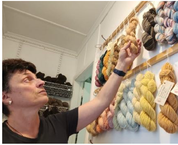
Patrizia - For the Love of Wool