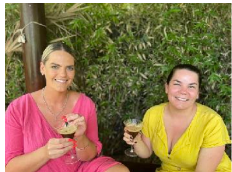
The Secret Garden

"You bring the fun and we will provide a private bar, your very own bartender, a variety of food options to suit all budget and plenty more at Cambridge's The Good Union cafe.