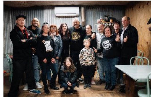
The Secret Garden

Looking for a “nook or cranny” to hide away over a cold beer or glass or wine The Shearers Quarters Cafe offers just that, a slice of retro rustic heaven hidden away on a quiet backroad in the tiny hamlet of Seadown, just north of Timaru.