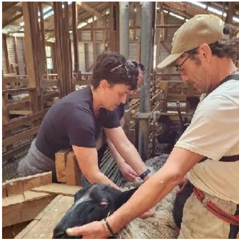
Rewa Rewa Station